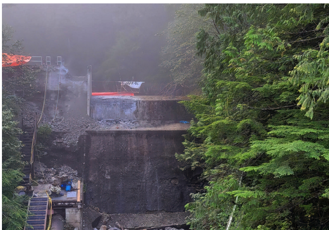
Preservation of a significant First Nations cultural symbol: the ceremonial cedar tree

In addition to all the solutions reducing the concrete, rock anchor volume and excavations, the best environmental practices were put in place throughout the project to ensure its sustainability.