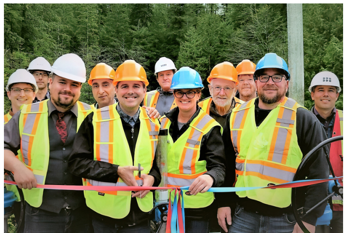
Oct. 14, 2022 – A celebratory delegation of more than 25 staff, city council members, contractors and media attended the remote dam location.